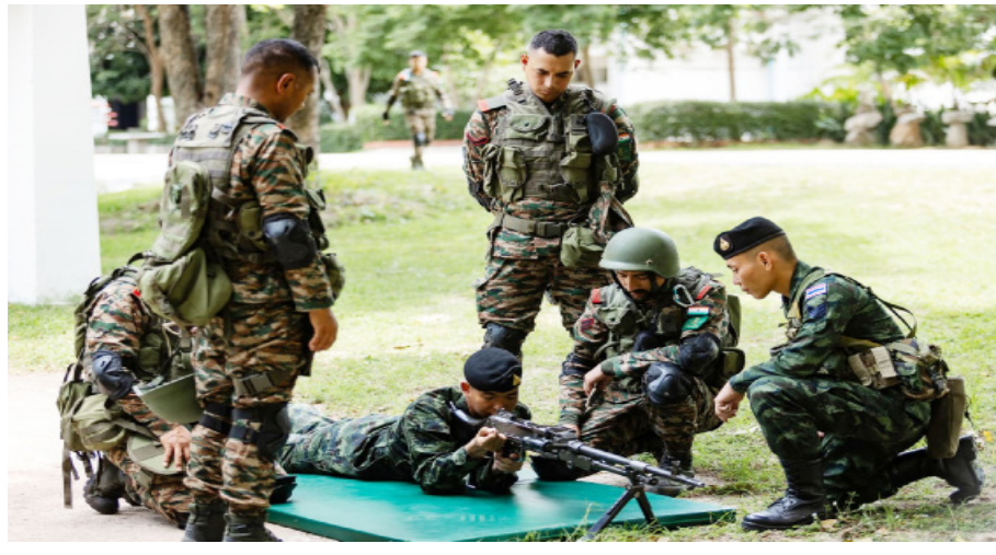
Top News Report

JAMMU, July 8: The joint military exercise Maitree 2024, between the Indian Army and the Royal Thailand Army, is currently underway at Tak Province in Thailand.