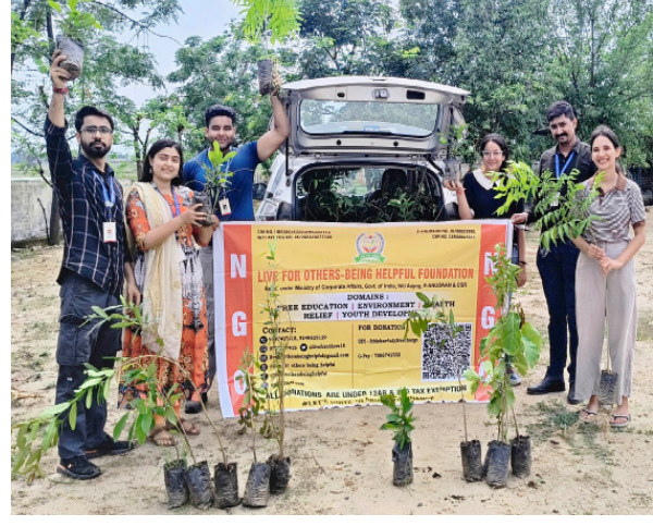
Top News Report

VIJAYPUR, July 8: In a dedicated effort towards a greener future, Live For Others-Being Helpful Foundation (LFO-BHF), in collaboration with Talla Jewellers, organized a plantation drive at Village Kehranwali, Tehsil Ramgarh, Vijaypur.