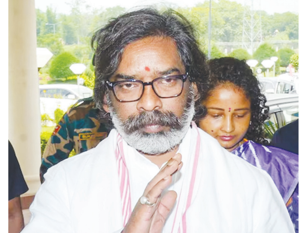
expected to expand his Cabinet after passing