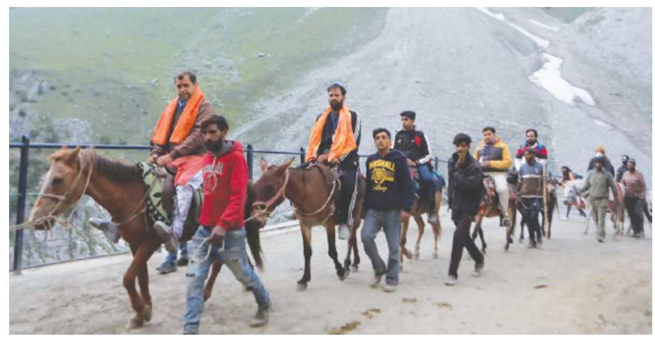
Yatris left at 3.10 a.m. for the North Kashmir

Officials of Shri Amarnathji Shrine Board (SASB) said, "Another batch of 5803 yatris left Bhagwati Nagar Yatri Niwas in Jammu for the Valley in two escorted convoys today. The first escorted convoy of 88 vehicles carrying 1862