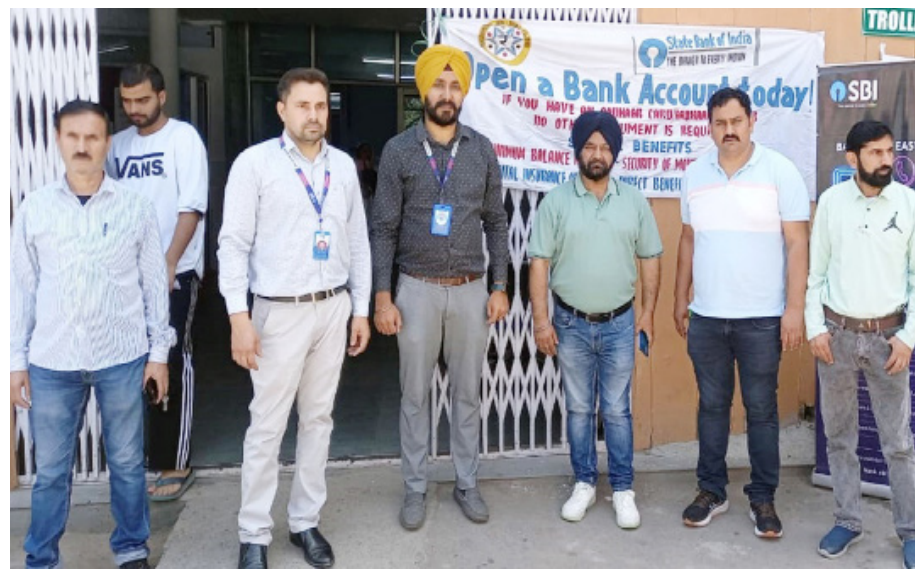
Top News Report

BATOTE, July 8: State Bank of India (SBI) on Monday initiated a significant plantation drive at the Community Health Center in Batote, marking a collaborative effort towards environmental sustainability and community engagement.