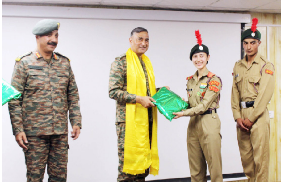
VSM then addressed the NCC Cadets of 1 Ladakh Bn NCC and encouraged

The GOC lauded the efforts of the Cadets and the Unit and distributed prizes to the outstanding Cadets. Maj Gen Madanraj Pande SM,