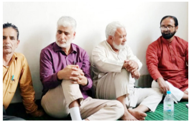
be held at district headquarters of Kupwara and a committee was framed to clear the modalities for ensuing convention.