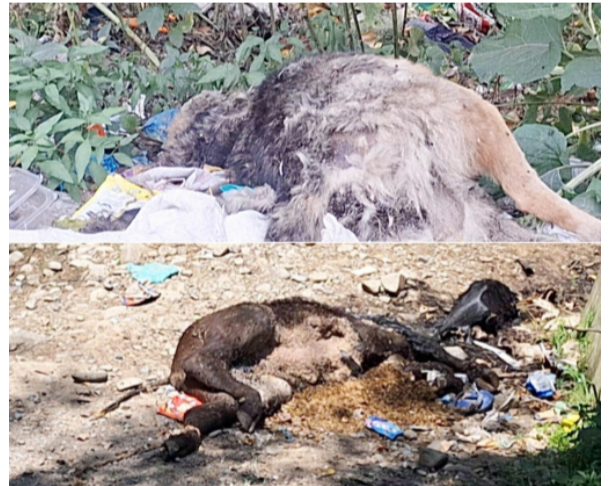
water from the same source where these dead animals have been thrown by some unknown miscreants.

They also said that situation gets more serious as the whole area is being supplied potable