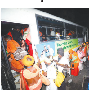
ed at a height of 3,880 metres on the first day of

About 14,000 pilgrims paid obeisance at the holy cave shrine locat-