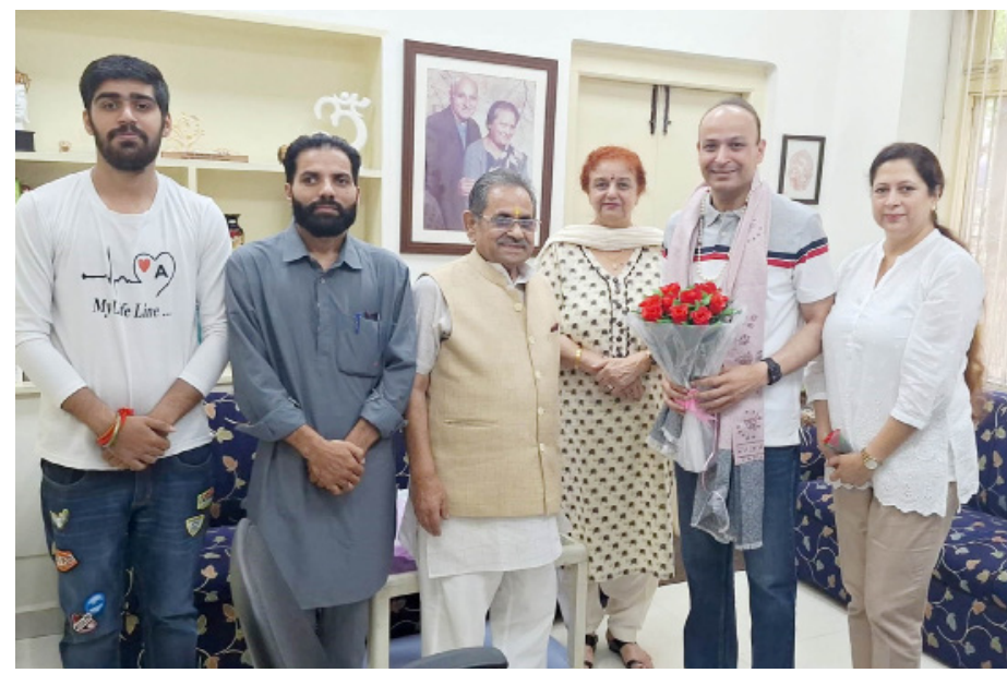
Top News Report

JAMMU, June 30 L The respiratory system takes up oxygen from the air, and we breathe and expel the unwanted carbon dioxide. The main organ of the respiratory system is lungs. Other respiratory organs include the nose, the trachea, and the breathing muscles ( the diaphragmic and intercostal muscles). our cells need oxygen to survive. One of the waste products produced by cells is another gas called carbon dioxide.