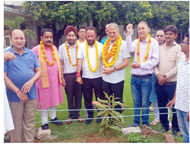
Top News Report

Initiates plantation drive under 'Ek Ped Maa Ke Naam' campaign at Ward 43