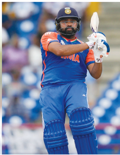
land) and Shaheen Shah Afridi (Pakistan).

Aaron Finch, who was sitting next to Gavaskar in the commentary box, reasoned that there are a lot more left-arm pacers nowadays, with not only Starc for Australia, but also the likes of Trent Boult (New Zea-