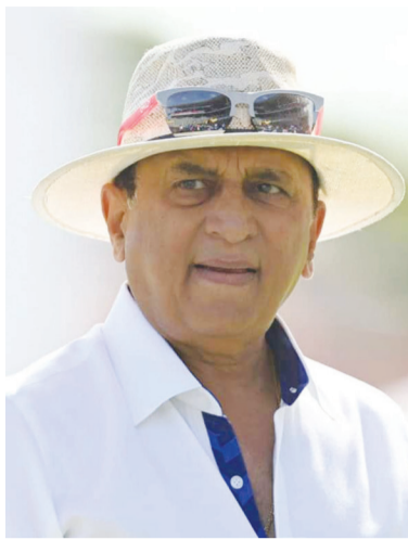
handers?" asked a bewildered Gavaskar.

"Thinking about Rohit Sharma once again, he got out to a left-hander (left-arm seamer). So before the next match, are we going to do another segment about his weakness to left-