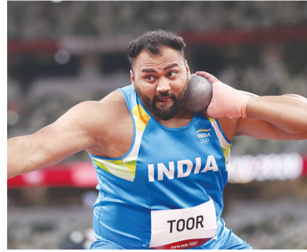
NEW DELHI, Jun 26 (Agencies): India's top shot putter Tajinderpal Singh Toor is coping with an ankle pain and will miss the National Inter-State Athletics Championships, the final qualifying event for the upcoming Paris Olympics, beginning in Panchkula on Thursday. Toor, an Asian record

holder till a few days back, is set to qualify for the Paris Games through the world ranking quota. He is the reigning Asian champion as well as the Asian Games gold medalist. "I am currently having slight ankle pain and my doctor told me not to throw for three-four weeks," Toor said with-