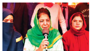
wrote: "While hundreds of elected Member Parliamentarians will take an oath today after their well earned victories, lacs of

Taking to micro-blogging site X Mehbooba