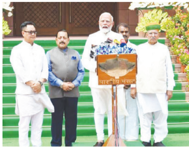
opposition to be responsible. The PM was speaking moments after the Congress-led opposition announced a boycott of the panel appointed to assist pro-tem speaker Bhartruhari Mahtab to administer oath to new MPs. The Congress has accused the government of ignoring its eight-term MP K Suresh for the post of pro-tem speaker. "People don't expect tantrums, drama and disruptions. People want substance, not slogans."

Reiterating that the government wants to take everyone along by consensus, the prime minister said people expect the