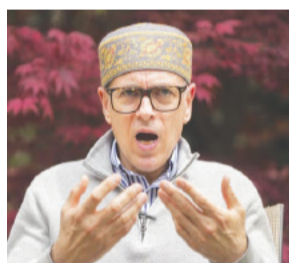
wouldn't expect BJP being humbled in the recent polls to change that, it would

SRINAGAR, Jun 24 (Agencies): National Conference leader Omar Abdullah on Monday said Prime Minister Narendra Modi should have spoken over the NEET row instead of attacking the opposition on the first day of Parliament session. "While attacking the opposition is the prerogative of the Hon PM & we