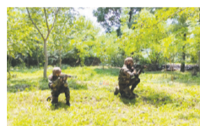
a search operation in the vast forest belts, they said. Security has been tightened at the famous Patnitop tourist resort. The operation was still

There were reports of suspicious movement in the Karlah area of Patnitop prompting police and security forces to launch