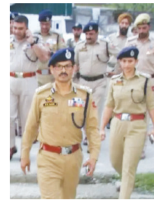
few months, he claimed. Talking to reporters on the sidelines of a function here, the police chief said

The Jammu region will be cleared of all foreign terrorists within the next