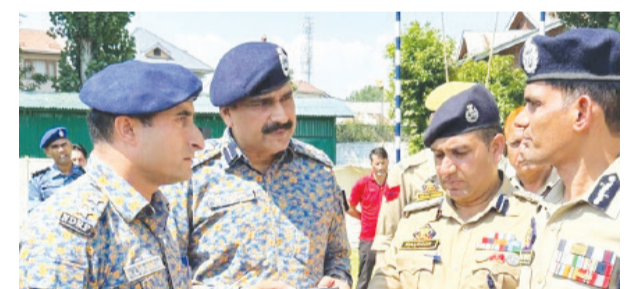
officers also inspected the equipment and briefed the