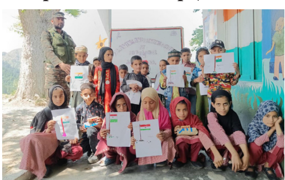
Top News Report

POONCH, Jun 23: 'Drawing Competition under Kargil Vijay Diwas theme' was organised at PirTopa by Indian Army. The event was organised for students of Govt Middle School, Pir Topa. The Competition was organized for the age group between 06 to 15 years. The event highlighted the commitment and valour of the Indian Army for main-