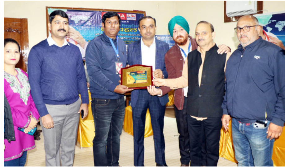
the physical and mental benefits of this ancient practice. The Yogatvam

The event featured an inspiring yoga session followed by a demonstration of advanced postures, showcasing