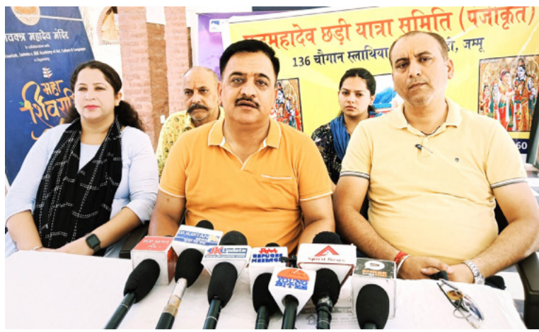
lai, a significant location on the Yatra route, is believed to be where Lord Shiva married Mata Parvati. The temple at Sudhmahadev

The Samiti highlighted the religious significance of Sudhmahadev, which is referred in texts like the Padam Puran and Shiv Puran. Manta-