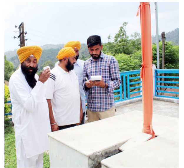
to society. Indian Army expressed its deepest gratitude for their sacrifice.

RAJOURI, June 17: Living up to the traditions of maintaining contact with Veer Naris and Veterans, Indian Army organized door to door interactive session with Veer Naris and Ex- servicemen at Keri, Rajouri District with an intention to resolve grievances and to assist them in conveying the latest policies pertaining to pensions or other documentation procedures. Veer Naris and Veterans embody the indomitable spirit of our nation. Their resilience and determination to move forward despite challenges serve as a shining example