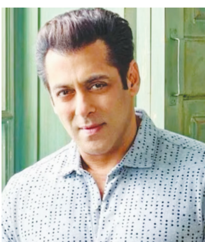
he visited for film shooting. There were even attempts to get weapons from abroad, he said.

The police said they learnt that the four arrested gang members had receded Salman's farmhouse in Panvel, the area around his home at Bandra in Mumbai and places