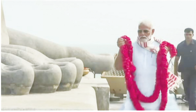
later reached the shore using the service.

On conclusion of his "dhyam" session, Modi, clad in white, visited the 133-ft statue of Thiruvalluvar, located next to the rock memorial and placed a huge garland there marking his tribute. He arrived at the statue complex by a ferry service and