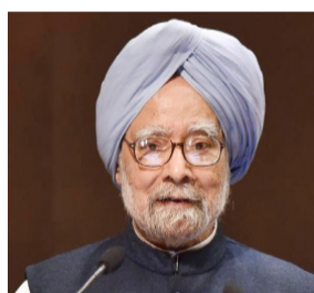
in Punjab on Thursday, Dr Singh stated,

NEW DELHI, May 31: Former prime minister Dr Manmohan Singh has accused Prime Minister Narendra Modi of "lowering the dignity of the Prime Minister's Office with hate speeches," and denied ever singling out a community for special treatment. In a three-page appeal to voters