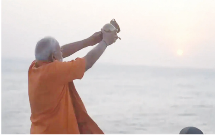
the sea as an offering (Arghya) and prayed using his prayer beads (Japa mala). The BJP also posted photo-

A short video clip, 'Sunrise, Surya Arghya, Spirituality,' posted by the BJP on its 'X' handle showed the PM pouring little water from a traditional, beaker-like small vessel into