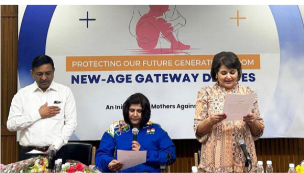
with 'Mothers Against Vaping' in their efforts to eradicate the menace of vaping from the lives of children.

Kushboo Sundar, actress, politician and a special invitee of BJP National Executive Committee and a member of the National Commission for Women and Kishwar Desai, Author and Columnist joined 'Mothers Against Vaping' and bolstered the cause. They join a distinguished group of leading sports icons and influential role models like Baichung Bhutia, Deepa Malik and Neha Dhupia who stand