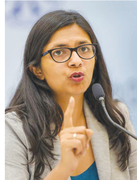
NEW DELHI, May 14 (Agencies): A ruckus erupted in the MCD House here on Tuesday over the allegations