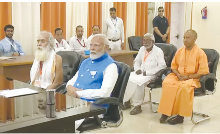
In a post in Hindi on X, Modi said, "My relationship with my Kashi is amazing, inseparable and incomparable...all I can say

VARANASI, May 14 (Agencies): Prime Minister Narendra Modi on Tuesday filed his nomination from the Varanasi Lok Sabha seat after offering prayers at the Dashashwamedh Ghat and the Kaal Bhairav temple here. Uttar Pradesh Chief Minister Yogi Adityanath was among those present at the collectorate when Modi filed his papers. Earlier in the day, the PM offered prayers at the Dashashwamedh Ghat on the banks of the Ganga. He also performed aarti at the ghat amid chanting of Vedic mantras.