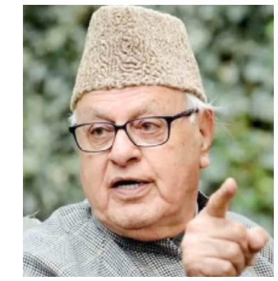
president asked the people to fear only God