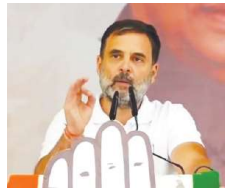
Rather than helping the hilly state, Modi made an attempt to "steal" the state's elected government, Gandhi said. His statement came

SHIMLA, May 26 (Agencies): Prime Minister Narendra Modi waived loans worth Rs 16 lakh-crore of 22 people in the last 10 years but could not give Rs 9,000 crore to deal with the disaster caused by monsoon rains in Himachal Pradesh last year, Congress leader Rahul Gandhi said on Sunday.