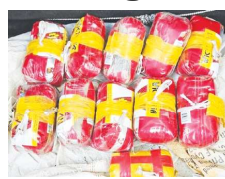
officer said on Sunday. Director General of

CHANDIGARH, May 26 (Agencies): The Punjab Police has busted an "international" drugs smuggling module with the arrest of seven people and recovered 5.47 kilogrammes of heroin in the Fazilka district, the state's top