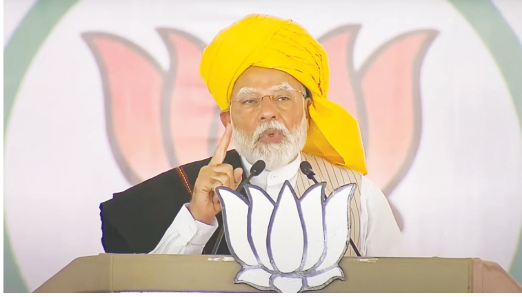
Sharad Pawar without taking his name.

"When a big Maharashtra leader was Union agriculture minister, farmers used to make rounds of sugarcane commission for their arrears," Modi said at a rally in Malshiras of Solapur district in Maharashtra. "There is a 'bhakti' (wandering soul) in Maharashtra. If it does not manage success it spoils others' good work. Maharashtra has been a victim of it," Modi had said at a rally on Monday, hitting out at