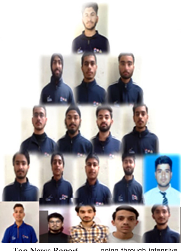
Top News Report

JAMMU, Apr 27: Eighteen underprivileged students of White Knight Corps scripted history by cracking JEE PHASE-II (Exam) this year after