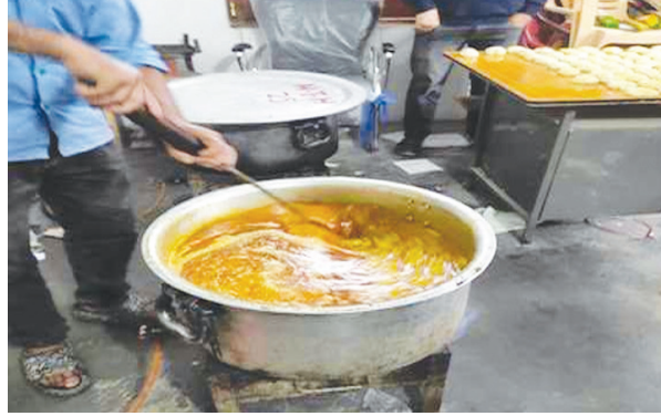
Baseer-UI-Haq, posted on 'X', "Continue effort