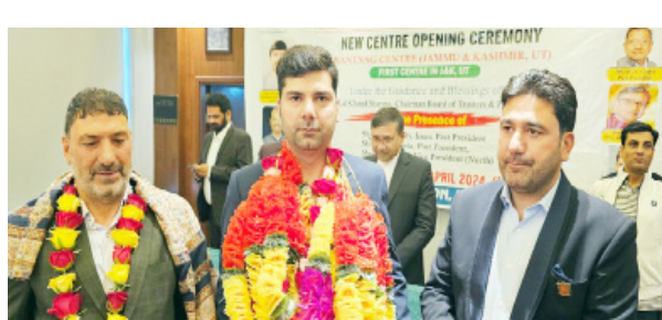
Top News Report