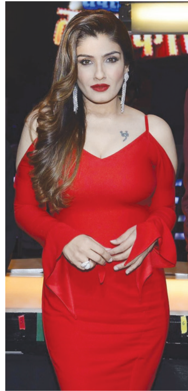
Actress Raveena Tandon revealed that she turned down five films before making her

debut with 'Patthar Ke Phool' in 1991, alongside superstar Salman Khan.