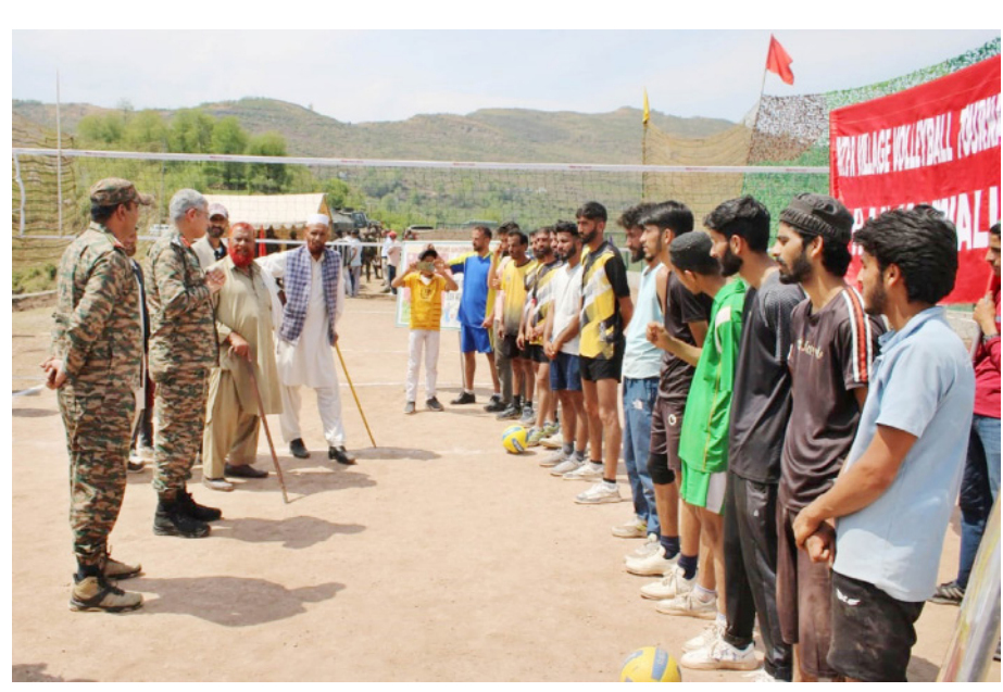
Top News Report

RAJOURI, Apr 13: Eid-UI-Fitr cheers had barely diminished before giving way to the excitement created by the teams of Upper Sarola and Upper Mangalnar fighting it out for ultimate glory in Inter Village Volleyball intense final was a fitting end to a week long tournament, in which ten teams participated, with Upper Mangalnar team emerging victorious. All the matches were conducted in the newly constructed Volleyball Court by Indian Army at Sarola Village, very close to Line of Control