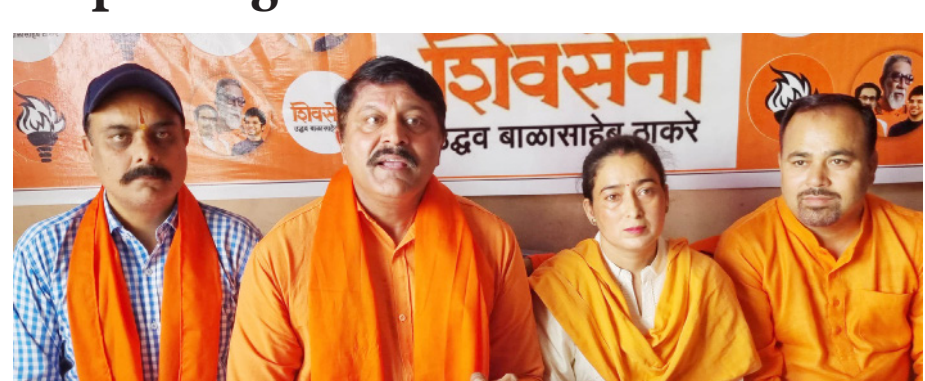
Top News Report

JAMMU, Apr 13: Shiv Sena (UBT) Jammu-Kashmir unit has demanded to take strict steps to curb the looting being done by the nexus of private schools, book and uniform sellers and to improve the level of education and facilities in government schools.