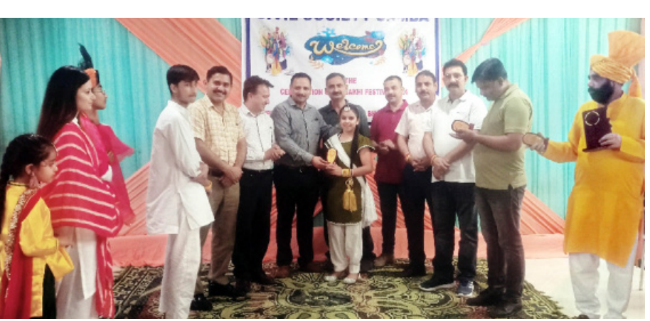
Top News Report

SAMBA, Apr 13: The annual festival Baisakhi was organised by civil society, Samba today, based on promoting local culture & language at Rajput Sabha Bhawan.