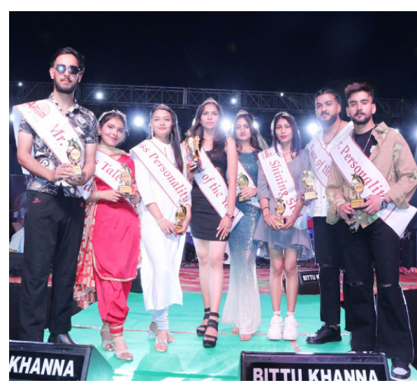
Top News Report

Aryans students from JK, Punjab, Haryana declared winners for various titles