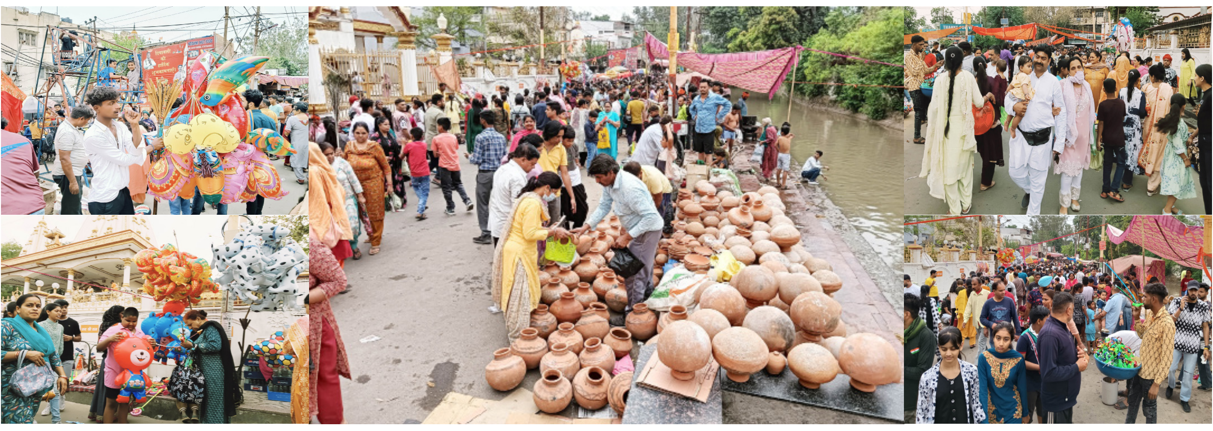
Jammuites thronged in the Baisakhi Festival Fair held at Canal Head in Jammu on Saturday.