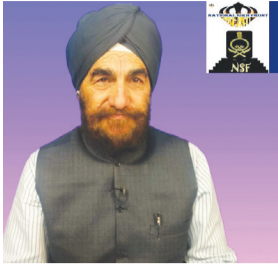
on the Sikh community.