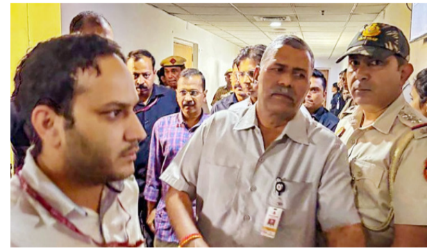
Swarana Kanta Sharma upheld Kejriwal's arrest as valid and dismissed his petition. The Court

Hearing a plea challenging his arrest by ED in a money laundering case registered in connection with the alleged liquor policy scam, Justice