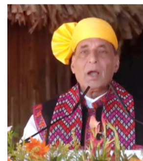
names of 30 places in the northeastern state will not change the ground reality.

Addressing an election rally at Namsal in Arunachal Pradesh East Constituency, Singh said China's move to change