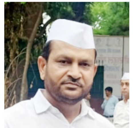
It has become clear that people will now ignore BJP candidates and join hands with Congress.

In Jammu and Kashmir, senior Congress leaders are contesting elections from Jammu and Kathua seats. Wherever Congress leaders are going, they are getting immense support.