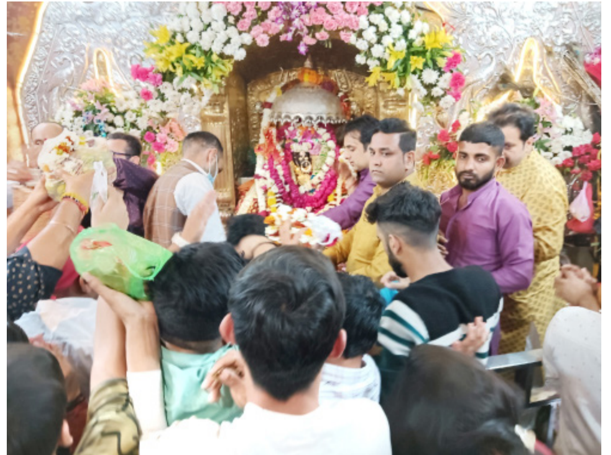
Devotees throng to pay obeisance at Bawe Wali Mata Temple on First Navratri in Jammu on Tuesday.