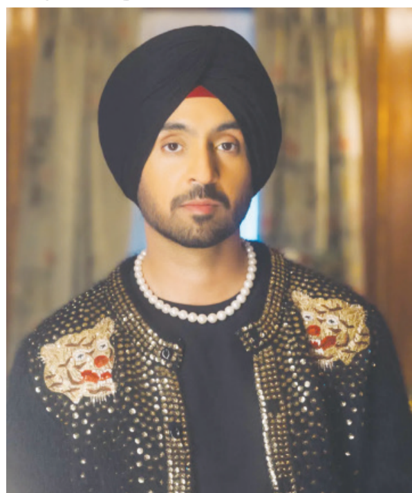
perform on stage. I got a lot of help from Imtiaz sir." Dosanjh believes the

"I didn't do much prep for the film, Imtiaz sir prepped a lot. He had a clear vision about the character of Chamkila. I knew Chamkila as an artist, but I had no idea about how he was as a person or how he would