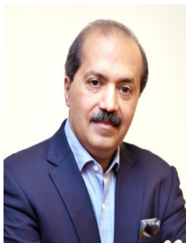
Citigroup's Global Management Committee and Asia Executive Operating Committee.

He served as the CEO of Citigroup's Indian and South Asian operations and was a member of