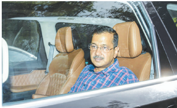
Kejriwal was arrested by the Enforcement Directorate (ED) in the excise policy case on