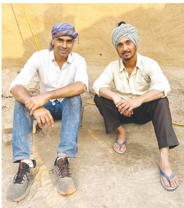
intellectuals and are connected by music or cinema. To connect with those people and the

"We travelled to small villages and met people who make most of this state and this country, which are rural people. They don't claim to be