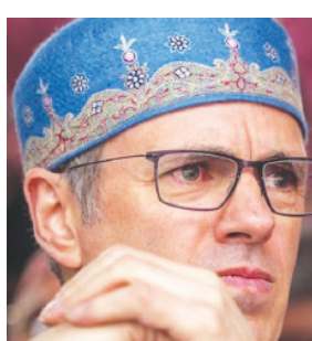
with Kejriwal and his Aam Aadmi Party. "Aisi Taisi Democracy.

The former Jammu and Kashmir chief minister said his party stands