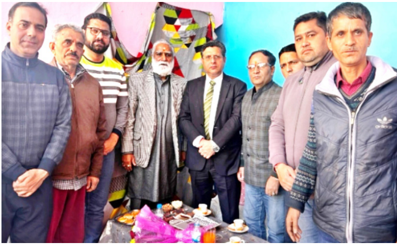
Top News Report