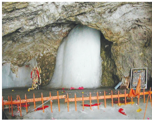
"After the conclusion of the Lok Sabha Polls, the administration will get busy with Shri Amarnath preparations, which is likely to commence from

JAMMU, Mar 21 (Agencies): The annual Shri Amarnath yatra this year is likely to begin from June 29. Official sources said that Lieutenant Governor Manoj Sinha, who is also Chairman of Shri Amarnath Shrine Board, chaired a meeting here at Raj Bhawan to discuss arrangements and preparations for the yatra. The 52-day long pilgrimage to conclude on August 19—on the occasion of Rakshabandhan.