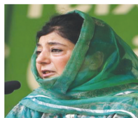
"All kinds of injustices are being done and

SRINAGAR, Mar 21 (Agencies): Peoples Democratic Party president Mehbooba Mufti on Thursday said voting is the only power left with people of Jammu and Kashmir as the BJP-ruled Centre is making all efforts to suppress their voices.