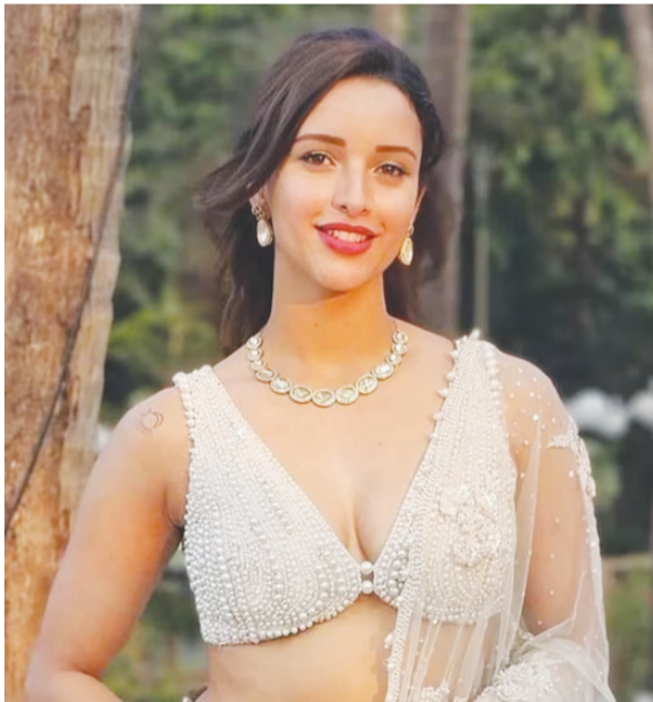
the third instalment of the Hindi horror-come-

The film, which also stars Vidya Balan, is