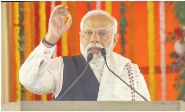
after such facilities at Gorakhpur and Ramagundam, which were

This is the third fertiliser plant to be revived in the country,