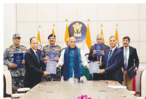
nents, which would help increase the indigenous content of future repair and overhaul tasks of RD-33 aero-engines," the Ministry of Defence said.

"The programme will focus on indigenisation of several high-value critical compo-