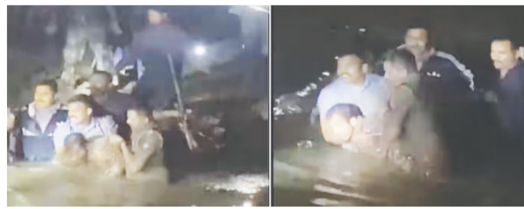
ing him with an axe, in the Koodan village of Boisar area, news agency reported.

According to the Palghar Police, the man allegedly first killed a senior citizen by attack-