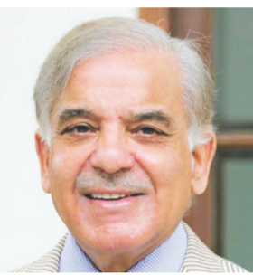
Modi wrote: "Congratulations to @CMShehbaz on being sworn in as the