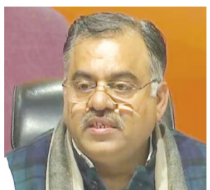
in Jammu and Kashmir now.