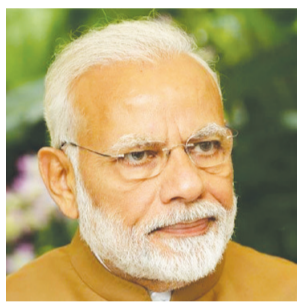
the Aiwan-i-Sadr, the presidential residence. Taking to his X, PM

Pakistan Muslim League-Nawaz (PML-N) President Sharif, 72, was administered the oath of office on Monday in a ceremony held at