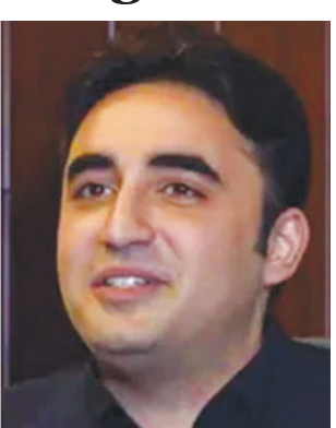
emerged as the single largest party in the polls.