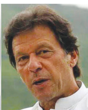
Nawaz had claimed that PML(N) has