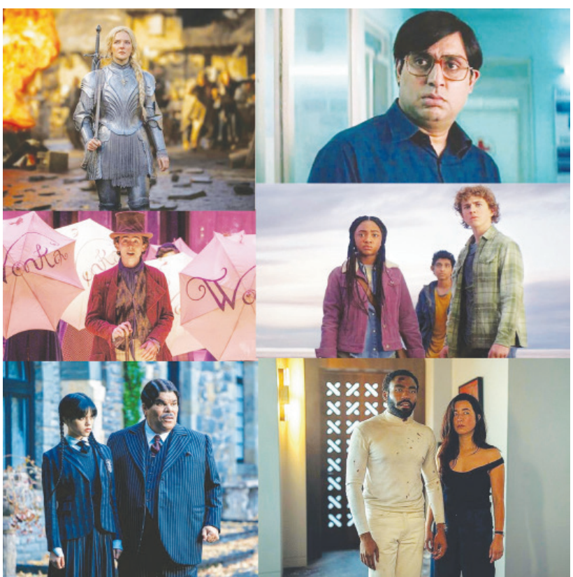
and makes for a revived IP, which is there to last.

The eight-episode first season of the supernatural comedy-horror series Wednesday became an instant favourite of binge-watchers, with netizens crushing over actress Jenna Ortega, who played the titular character. The makers of the series re-imagined the once sopopular and readily adapted show/ film called The Addams Family. Initially a single-panel comic published in The New Yorker in 1938, it was made into animation films and video games until the first film series, The Addams Family (1991) and then Addams Family Values (1993) were released. In November 2022, web series Wednesday re-launched The Addams Family back into limelight. Based on its commercial and critical success, the series immediately got renewed for the second season