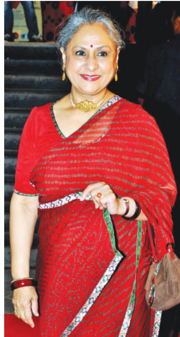
Veteran actress and politician Jaya Bachchan, who often gets into a playful tiff with the

paparazzi, has said she doesn't mind being the source for such entertainment and a 'meme-generator'.