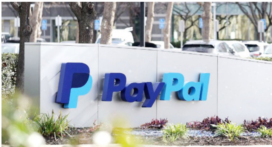
Block and Zelle. What did PayPal CEO say?

Chriss said the layoffs were necessitated in order to 'right-size' its business and focus on automation. PayPal is also seeing diminished growth in its branded products amid pressure from rivals like Apple,