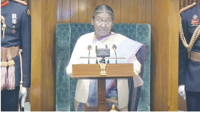
According to NITI Aayog, in the last 10 years, nearly 25 crore people have come out of poverty, she said, adding, "In the

Building of Ram temple has been a dream of centuries, it is a reality now, President Murmu said.