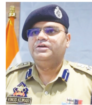
under the leadership of SSP Jammu," official sources said.

"The anti-drug cell to control drug abuse in Jammu district will directly be working