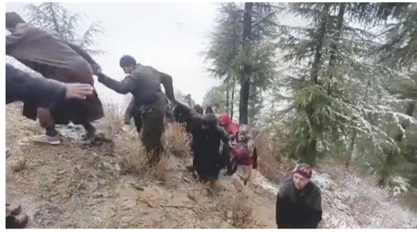
mulla Uri this afternoon, leaving at least seven persons dead and

They said that a vehicle skidded off the road and plunged into a deep gorge at Bujthalan Tatt