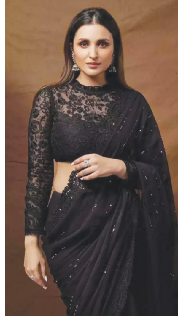
Actress Parineeti Chopra finally made her live singing debut and said the performance

was everything she could wish for. Parineeti took to Instagram, where she shared a motley of pictures giving a glimpse of what her concert looked like. She also shared a video where she said the event was special because she performed in her own city — Mumbai.