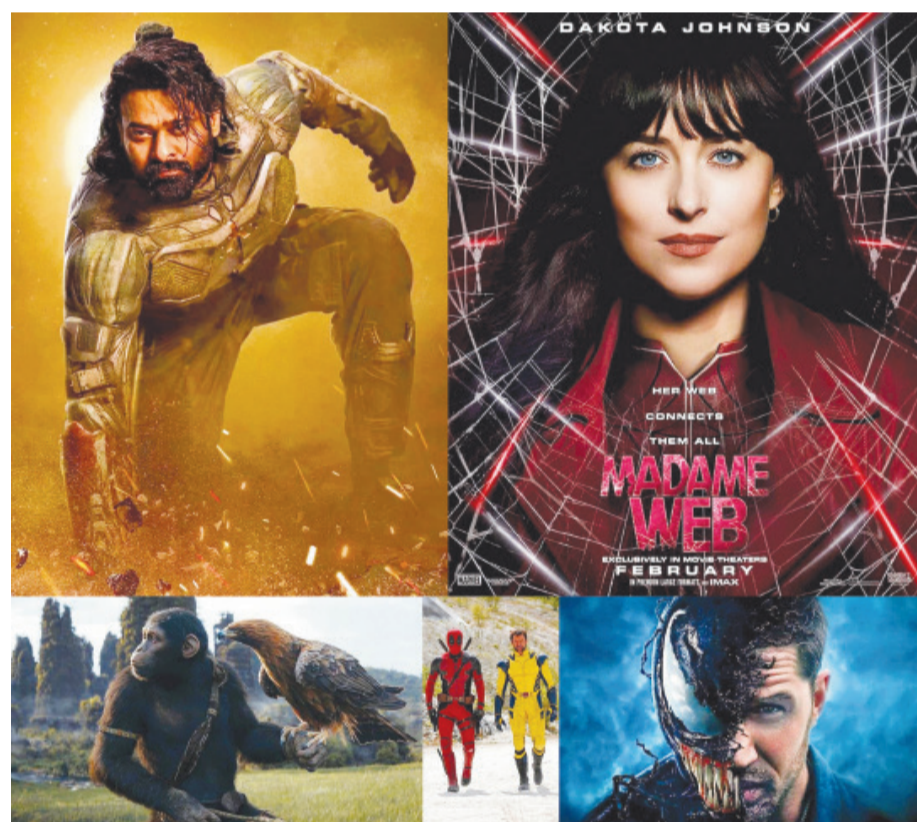
Sony's Spider-Man Universe (SSU). The character has extraordinary

Madame Web Dakota Johnson stars as the upcoming Marvel character Madame Web. The film is intended to be the fourth instalment in