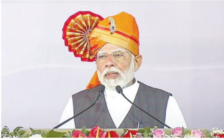
PMAY-Urban in Maharashtra.

He also dedicated more than 90,000 houses completed under