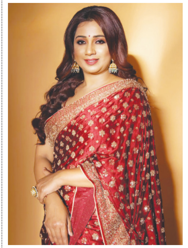
Singer Shreya Ghoshal has collaborated with music duo