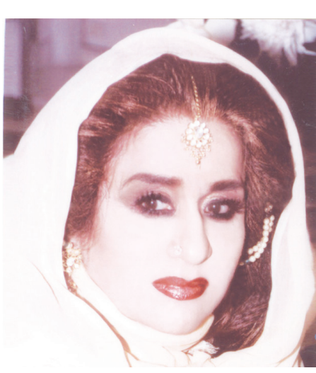
By: Shahnaz Husain

ull, dry, lusterless skin is result of regular exposure to dirt, dust and pollution in environment which accumulates toxins in deep pores.