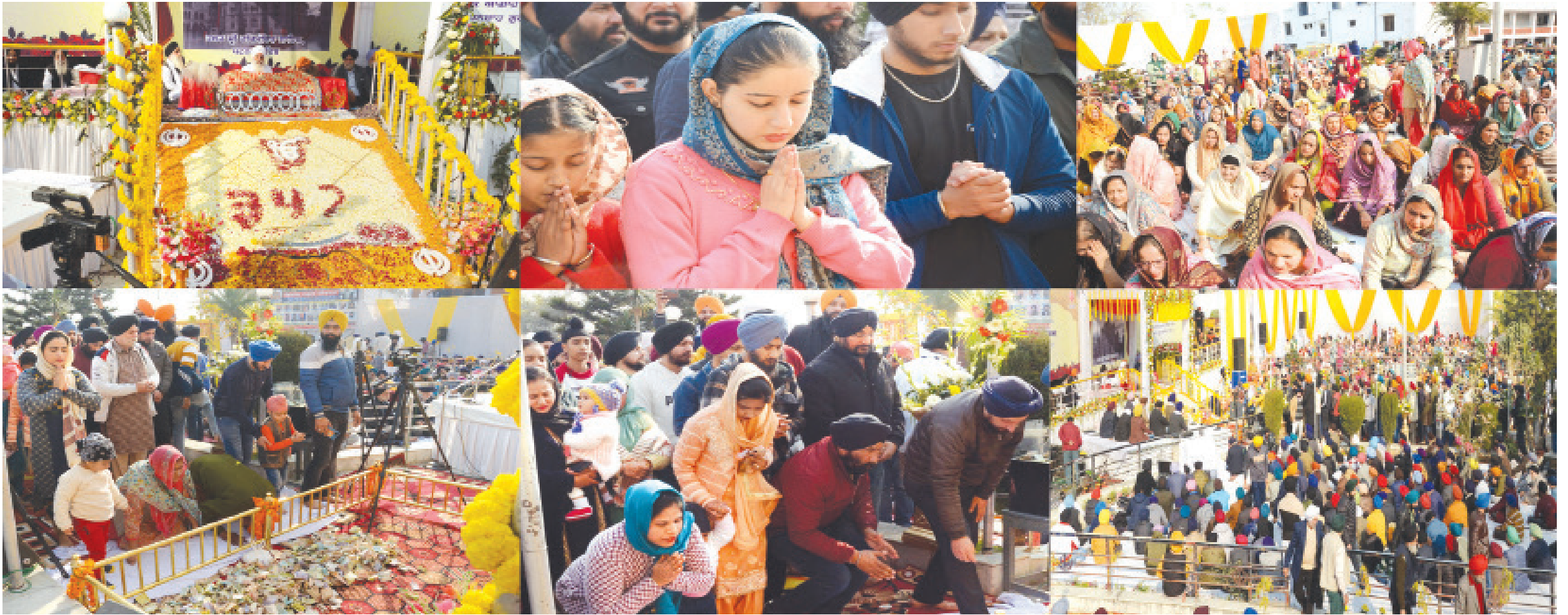
Sikh devotees visiting Digiana Ashram Gurdwara to mark the celebration of 357th Prakash Utsav of 10th Sikh Guru, Guru Gobind Singh on Wednesday in Jammu.