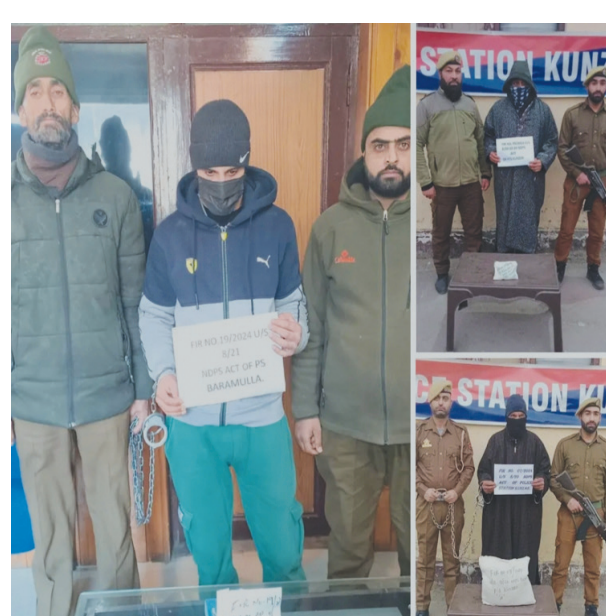
SRINAGAR, Jan 17 (Agencies): Continuing its efforts to eradicate the menace of drugs from the society, Police