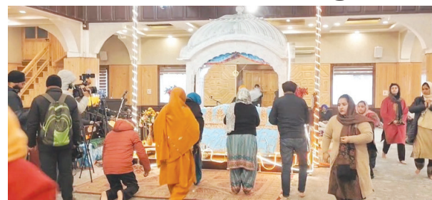
SRINAGAR, Jan 17 : Sikh devotees on Wednesday prayed for a wet spell

in Jammu and Kashmir as they celebrated the Guru Gobind Singh Ji's 357 birthday.