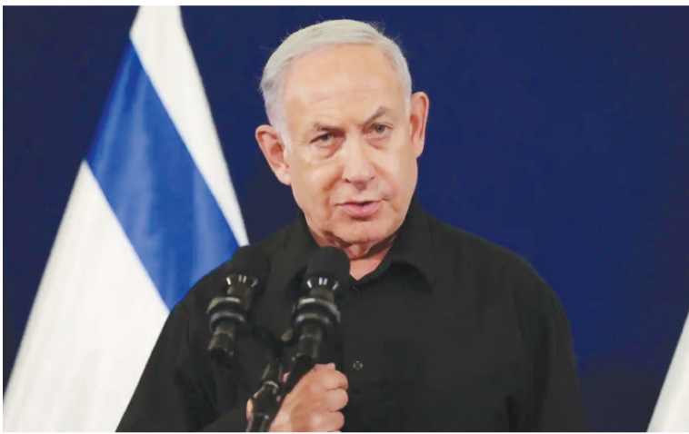
Justice in The Hague, alleging Israel’s offensive is in breach of the UN Genocide Conven-

He was referring to a case brought before the UN’s top court, the International Court of