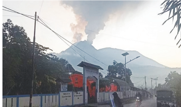
(13,100 feet) around its crater.

Authorities on Monday raised the volcano's status to the second-highest of Indonesia's four-tiered alert levels and expanded the exclusion zone from two kilometres to four kilometres