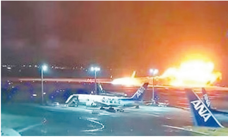
caught fire. Later video showed fire crews working to put out the fire. It wasn't immediately clear what

Local TV video showed a large burst of fire erupting from the side of a Japan Airlines plane as it taxied on a runway. The area around the wing then