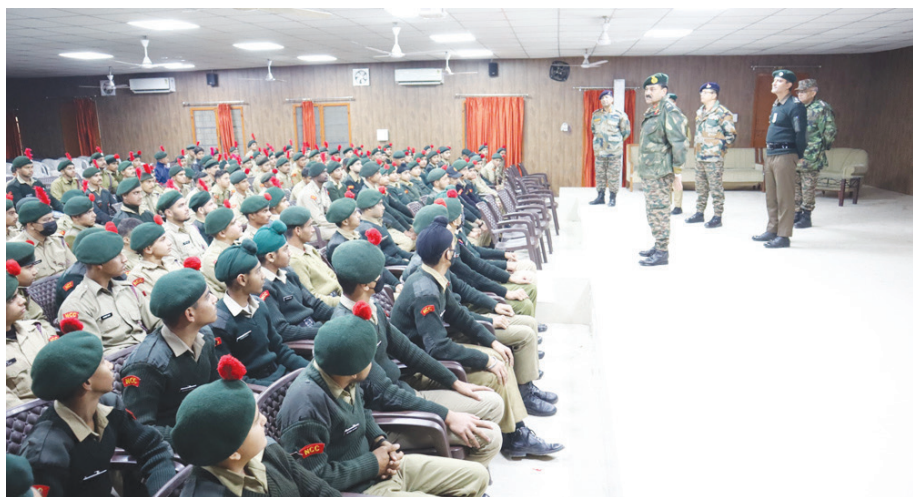
words of encouragement and sharing his invaluable insights and