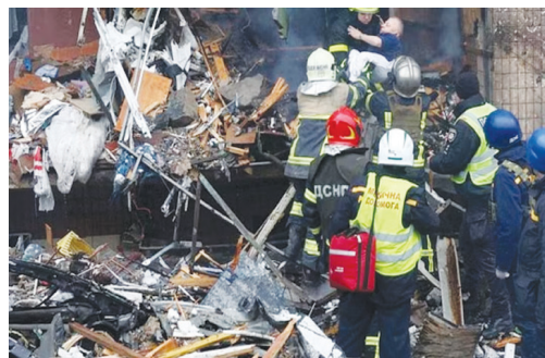
Russian news agencies. "There are no casualties," it added. Petropavlovka lies some 150 kilometres (93 miles) east of the Ukraine border. The ministry said six private houses were damaged in the accident, Russian news

"On January 2, 2024, at around 9 am Moscow time (GMT), during a flight of the Aerospace Forces, an abnormal discharge of aircraft ammunition occurred over the village of Petropavlovka in the Voronezh region," the Russian army said in a statement quoted by