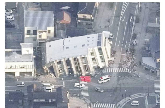
Monday afternoon. Forty-eight people were confirmed dead in Ishikawa, officials said. While damage to homes was so great that it could not immediately be assessed, they said.

Aftershocks continued to shake Ishikawa prefecture and nearby areas a day after a magnitude 7.6 temblor slammed the area on