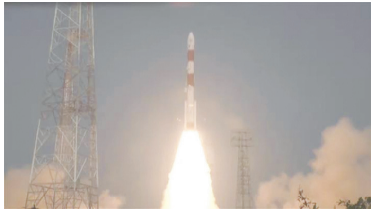
Earlier, ISRO has carried out space missions with its two rockets - PSLV and Geosynchronous Satellite Launch Vehicle (GSLV) in the month of January a couple of times, but not on the first day of a calendar year.

For the first time in its history, ISRO carried out a space mission on January 1.