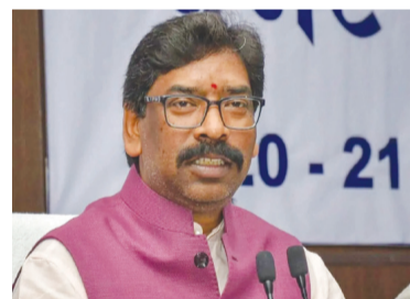
handle on X in Hindi.