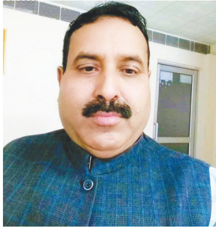
By Devraj Thakur

The promotion of teachers based on fake degrees poses a severe threat to the integrity of the education system and, consequently, to society at large. When educators obtain and utilize fraudulent credentials to advance their careers, it erodes the very foundation upon which a robust educational framework rests.