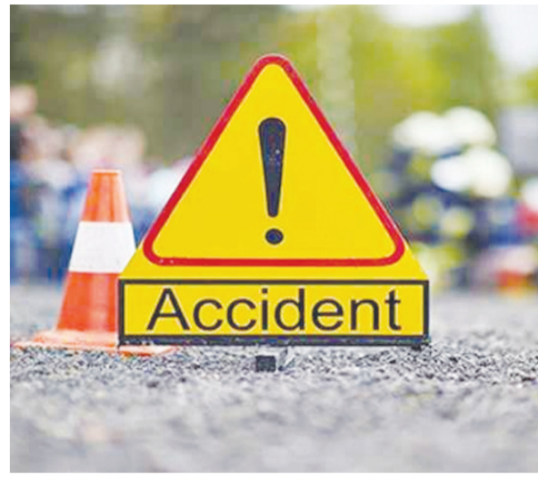
JAMSHEDPUR, Jan 1 (Agencies): Six people were killed and two others injured as the

car they were travelling in hit a road divider in Jamshedpur city of Jharkhand on Monday