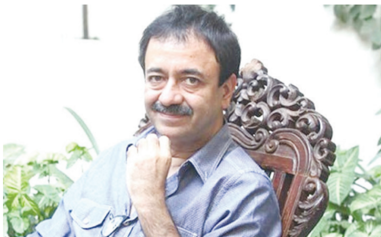
"PK" and "Sanju".

The 61-year-old is known for his unique brand of cinema that focuses on human stories with a touch of comedy and commerciality. His earlier films include the super successful "Munnabhai" films and "3 Idiots" as well as