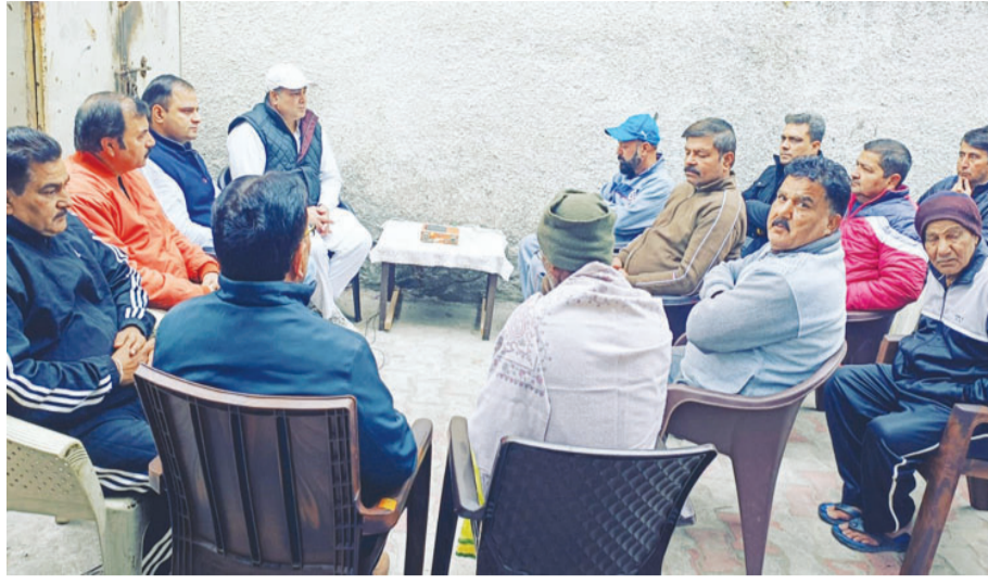
country in 2023.

He extended New Year greetings and discussed the achievements of the