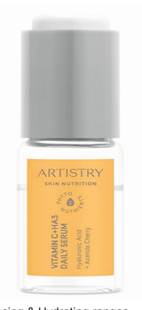
ancing & Hydrating ranges. Talking about the new launch,

Universally safe with all skin types, the Artistry Skin Nutrition Vitamin C+ HA3 Daily Serum seamlessly complements the Artistry Skin Nutrition range, encompassing Artistry Skin Nutrition Anti-aging, and Bal-