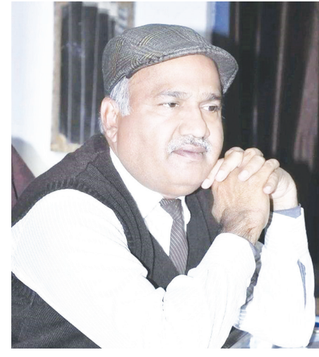
By: Vijay GarG

echnology has evolved into an essential tool for ■ both educators and students in today's ever-changing educational landscape. The classroom experience is changing because of numerous advancements, including interactive learning platforms and sophisticated AI-driven chatbots. As a versatile and dynamic addition to the educational arsenal, OpenAI's natural language processing (NLP) model, ChatGPT, stands out among them.