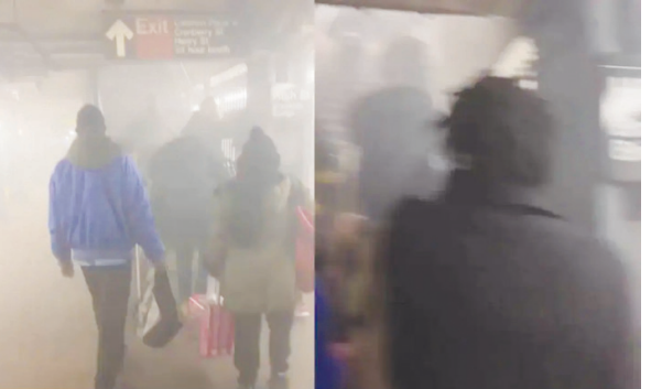
with delays in both direcparts of the subway. "A/C trains are running tions after FDNY (New

Several emergency crews, including fire tenders, rushed to the spot to rescue passengers trapped in smoke-filled train coaches and other