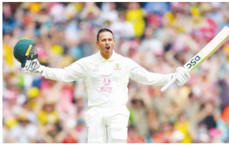
of the clothing and equipment regulations to Australian media.

An ICC spokesperson confirmed the charge in breach