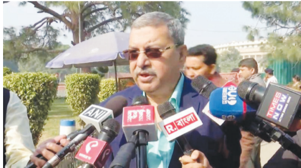
Banerjee said. Also, hitting out at Prime Minister Narendra Modi, the TMC MP said, "Even the PM mimicked Opposition leaders in the Lok Sabha between 2014 and 2019. He did it. But everyone took it as harmless humour, not seriously. Now, if they are taking it seriously in my case, I can't help it."

"I respect Dhankhar Sahib a lot. He's also a senior advocate, I'm too. I've great respect for Dhankhar-ji. First, he belongs in the same profession as me, and second, because he was formerly a governor (of West Bengal). He is our Vice President,"