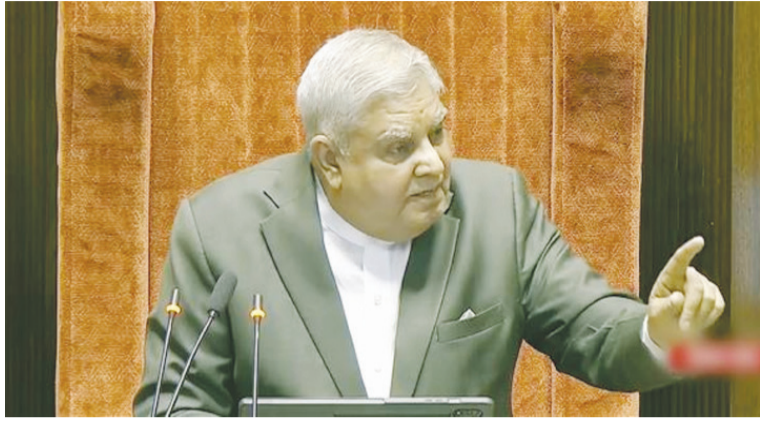
am after the third adjournment, Dhankhar expressed anguish over Tuesday's incident and asked the Congress party, including Leader of Opposition Mallikarjun Kharge, to ponder