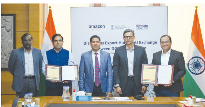
with to avail services like imaging, digital cataloging of their products, tax advisory amongst others.

Amazon will also enable access to a host of third-party service providers that MSMEs can engage