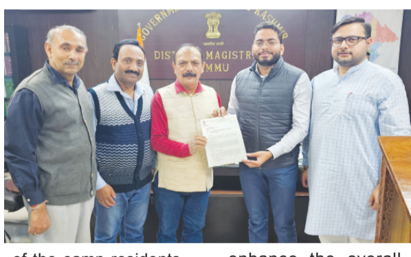
of the camp residents, the delegation urged the Deputy Commissioner to establish a 24x7 Fire Brigade station in or around Jagti Township for a swift response in the unfortunate event of a fire.

Additionally, the delegation emphasized the need for the installation of an open-air gym in all Kashmiri Pandit camps, enhancing the recreational facilities in Jagti, Nagrota, Muthi, and Purkhu camps.