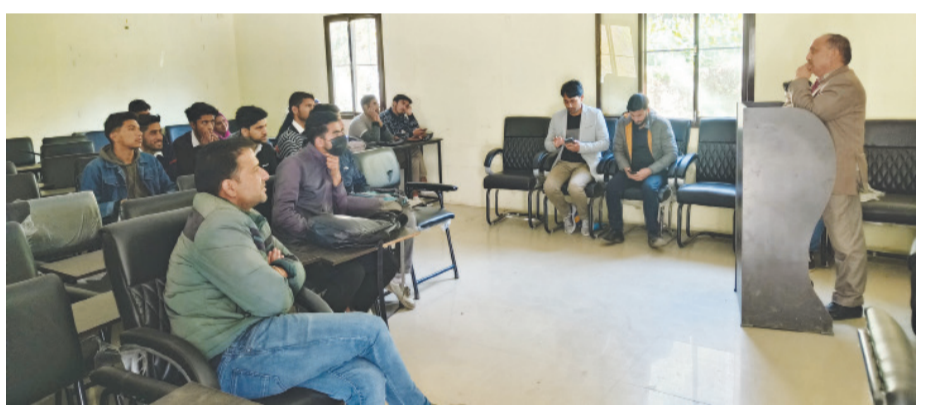
Principal of the college said that the day has also been declared as the Constitution Day to spread awareness about its architect Dr B.R. Ambedkar.