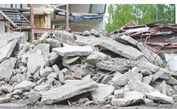
ETAWAH, Oct 28 (Agencies): A 22-year-old labourer was killed when a portion of a dilapidated building was pulling down fell on him in Uttar Pradesh's Etawah, police said on Saturday.