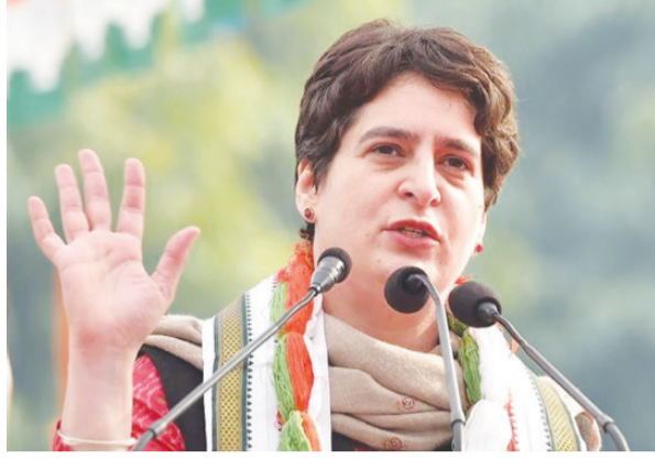
NEW DELHI, Oct 28 (Agencies): Slamming the BJP government at the Centre for abstaining from voting in the UN for a truce in Gaza, Congress on Saturday said the stand went "against everything our country has stood for throughout its life as a nation".

"I am shocked and ashamed that our coun-