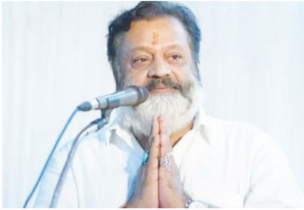
Kerala and Kerala Union of Working Journalists (KUWJ) condemned the BJP leader's behaviour.

Earlier, Democratic Youth Federation of India, the youth wing of the ruling CPI (M), Network of Women in Media,