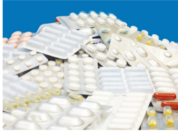
cation of a substantial quantity of counterfeit antibiotic drugs, according to a statement issued by FDCA Commissioner H.G. Koshia.

Acting on a credible tip-off, the FDCA officials conducted a raid at a medical shop in the Girdharnagar area of Himmatnagar and the raid led to the confis-