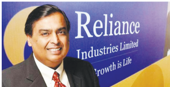
MUMBAI, Oct 28 (Agencies): Reliance Industries Limited chairman Mukesh Ambani has received an extortion-cum-death threat

via email, officials said here on Saturday.