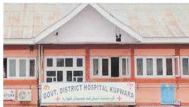
midnight. Given due care and

A woman (name withheld), from Keran Kupwara was admitted with labour pains at PHC Keran. Sensing exigency of the case, the doctors referred the woman to SDH Kupwara around