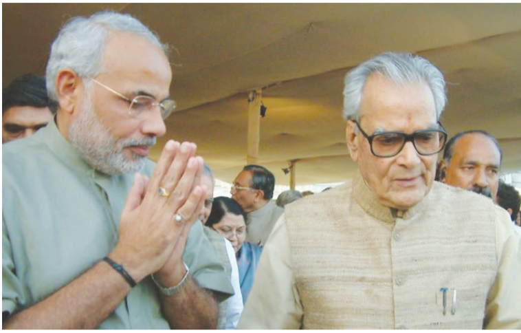
The PM also recalled the respect Shekhawat enjoyed across the political divide. He was someone who was

"Today is a very special day - it is the 100th birth anniversary of the respected statesman Shri Bhairon Singh Shekhawat Ji. India will always be grateful to him for his exemplary leadership and efforts towards our nation's progress," Modi wrote on X.