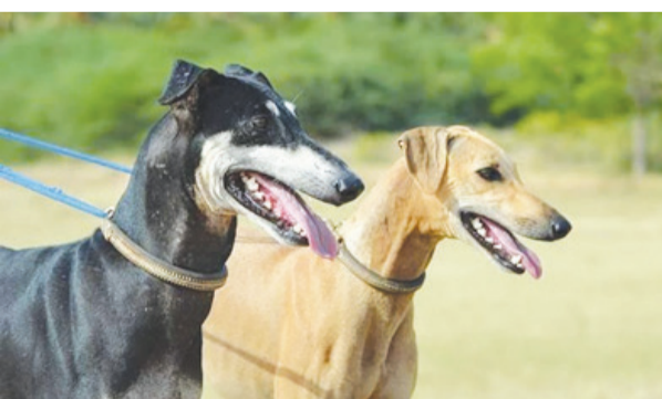
NEW DELHI, Oct 23 (Agencies): Indian dog breed Rampur hound, Himalayan mountain

canines Himachali shepherd, Gaddi and Bakharwal and the Tibetan mastiff are likely to be deployed soon for police duties like sniffing out suspects, narcotics and explosives, besides patrolling risk-prone areas, officials said.