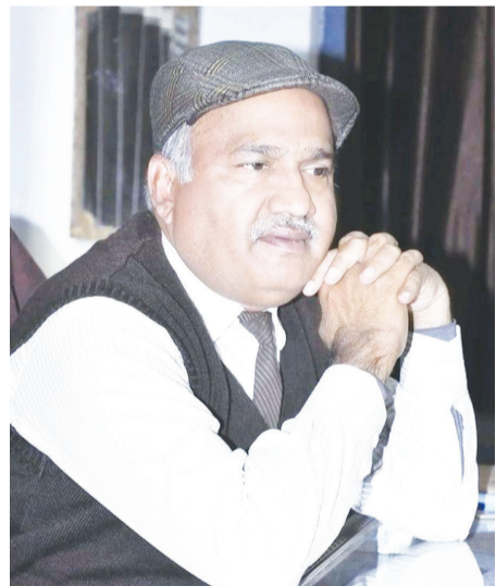
By: Vijay Garg

In the digital age, people are placing more emphasis on online shopping. Some time ago, small shopkeepers used to hope to increase their income during festivals, whereas now the festival sales available on e-commerce platforms have reduced the sales of shopkeepers. Before understanding this difference, it is important to know that one of the reasons for online shopping is wrong measurement of goods by the shopkeeper and charging more money. In today's time, people want to buy more and more products in less time at reasonable prices. People have so much time to spare the whole day for shopping, hence online shopping is increasing. Yes, one of the disadvantages of buying