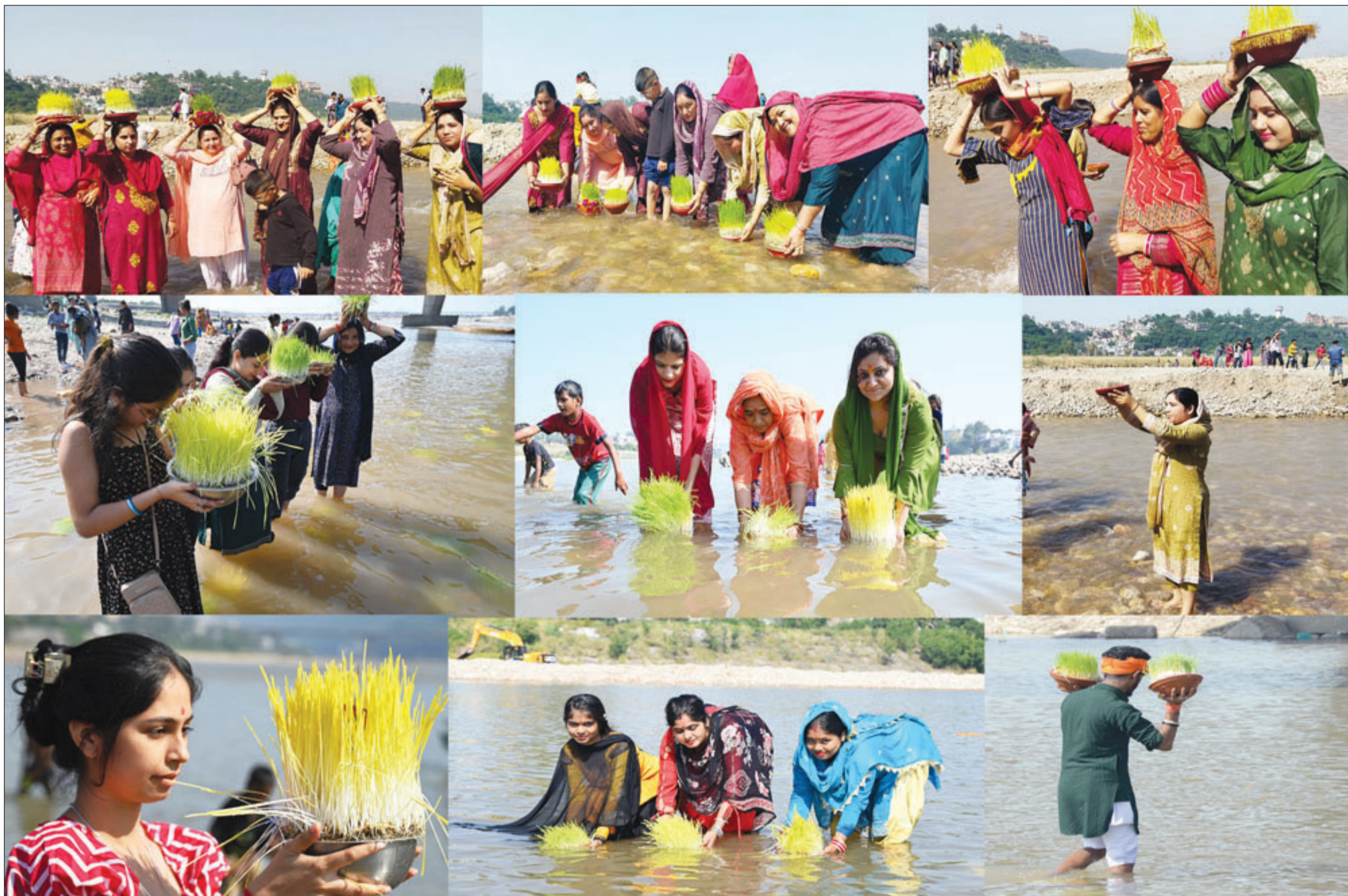
Devotees perform Sakh Visarjan on Mahanavmi on the last day of Navratri in Surya Putri Tawi at Hari Ki Pauri in Jammu on Monday.