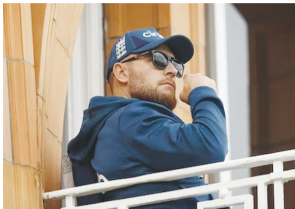
these successes to the quality of the players and their approach to the game.

dence in the team's ability to bounce back. "They will get there. It is still early days and this tournament is a slow burn, so there is plenty of time and matches for them to catch up," he said. He further added that upsets are part and parcel of any World Cup, and they add to the excitement and unpredictability of the tournament.