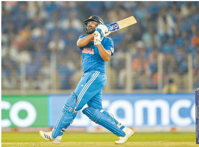
captain to lead India to their third ODI World Cup title, the second on home soil after the 2011 triumph.

NEW DELHI, Oct 19 (Agencies): Rohit Sharma is on the verge of adding a massive record to his already illustrious career as the Indian cricket team skipper can become the first batter from his country to hit 50 sixes in a calendar year. Right now, Rohit has 47 sixes and if he can hit 3 more sixes in the course of the Cricket World Cup 2023, he will be able to achieve the historic first. Overall, West Indies legend Chris Gayle and former South Africa star AB De Villiers are the only cricketers to achieve this feat. De Villiers tops the list with 58 sixes back in 2015 - a record that Rohit can potentially break considering the number of games left.