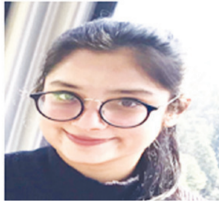
By: Kanka Pandita

It serves as a great wheel of circulation and a great instrument of commerce. Every fabrication of the modern economic society in its present complex form may be attributed to money that has served as a means of valuing, distributing and contracting for commodities of various kinds. No doubt money has conferred inestimable benefits to modern man's living and progress.