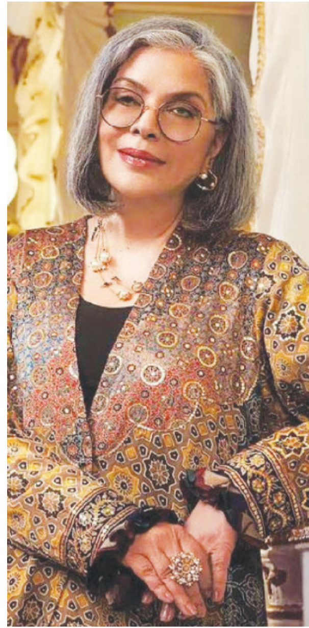
After sharing a cute picture of her pet dog, veteran actress Zeenat