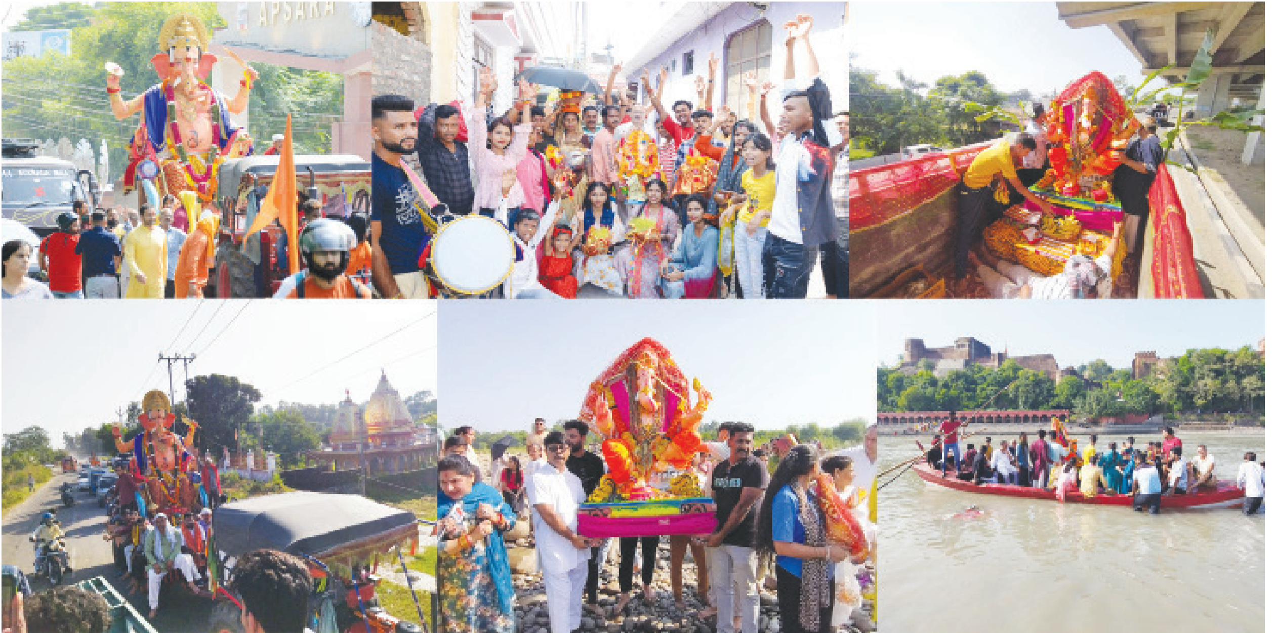
Glimpses of concluding celebration of ten days Bhagwan Ganesh Chaturthi with immersion of idols of Bhagwan Ganesh in River Chenab in Jammu.