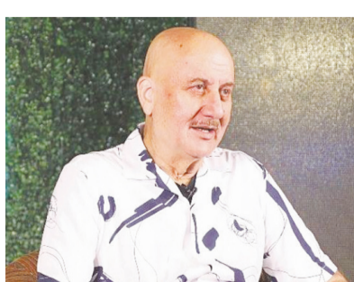
been a pivotal force in shaping both his personal life and professional journey. The session took the audience on an intimate explo-

With sharp wit, warmth and profound wisdom, Kher captivated the audience with anecdotes from his remarkable career. He shed light on how the concept of 'home' has