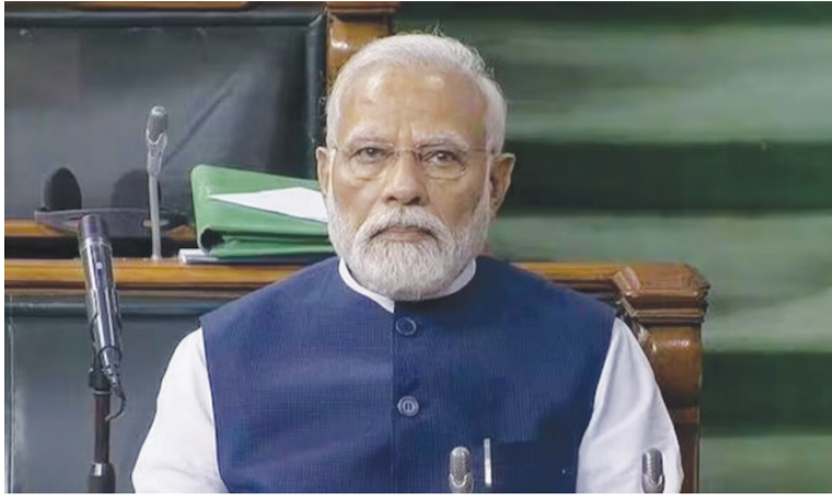
ing the bill would add strength to the country. The confidence of the country would soar higher and would provide an energy

that cannot even be visualised, Modi said.