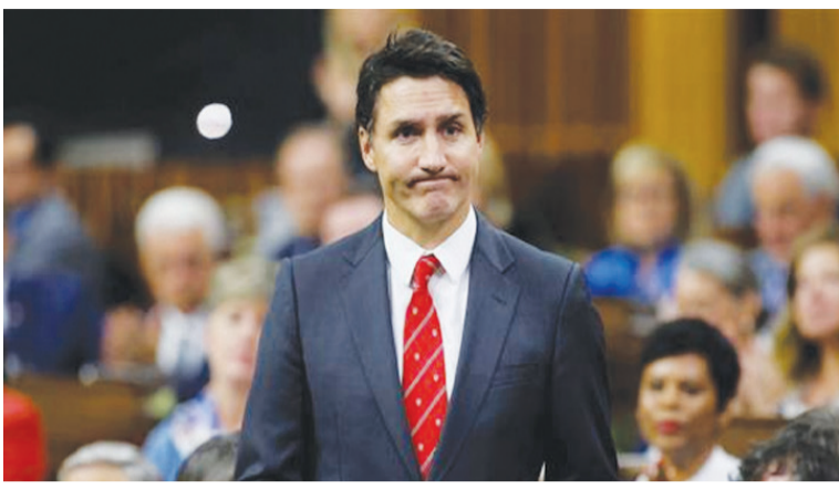
Canadian Broadcasting Corp said.

Nijjar supported a Sikh homeland in the form of an independent Khalistani state and had been branded by India as a "terrorist", the Canadian Broadcasting Corp said.