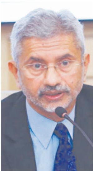
Foreign Minister Melanie Jolie while expelling an Indian diplomat as "absurd and motivated".

NEW DELHI, Sep 19 (Agencies): A new chill entered India's already-frosty ties with Ottawa after the Foreign Office here summoned the Canadian High Commissioner on Tuesday and expelled a senior diplomat in retaliation after Canada asked an Indian diplomat to leave the country and its Prime Minister Justin Trudeau alleged that the Indian Government may have had links to the killing of Khalistani separatist Hardeep Singh Nijjar in Surrey in June.