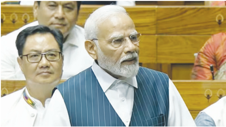
"Nari Shakti Vandan Adhiniyam" will further empower our democracy," said PM Modi.

PM Modi announced his government is "bringing an important constitutional amendment bill", taking forward "our resolve of women-led development"