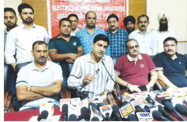
and hindering the delivery of public services and grievance redressal.

This decision stems from the government's failure to address the significant delay in filling vacant positions across the department's hierarchy, severely affecting the morale of its officers